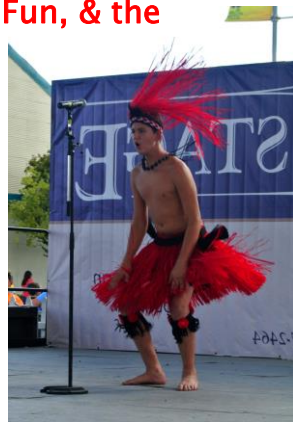
JAMMIN ISLAND HULA DANCERS

PRE-SALE TICKETS AVAILABLE Luuu Party & Show only $10 Call (661) 345-2626