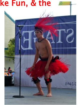
JAMMIN ISLAND HULA DANCERS

PRE-SALE TICKETS AVAILABLE Luuu Party & Show only $10 Call (661) 345-2626