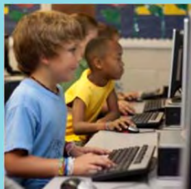
Computer and Technology